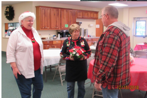
Thanks to all who participated!