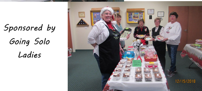
Sponsored by Going Solo Ladies