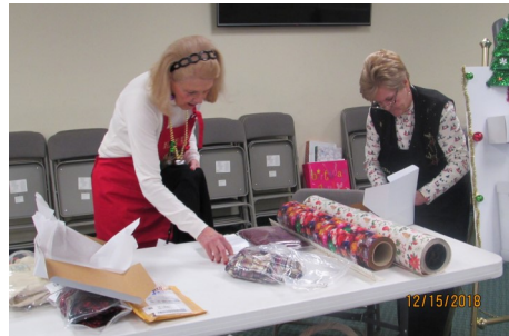
Gift Wrapping & Bake Sale 12/14-15

Please let me know at any time if you have a need for a shawl, as there is always an available supply of various items. If you identify a need and I cannot be reached, please feel free to take an item out of the small box kept in the back of the Sanctuary. It would be helpful to let me know if you take an item, so I can place it in the Recipients Record and make sure the box is replenished.