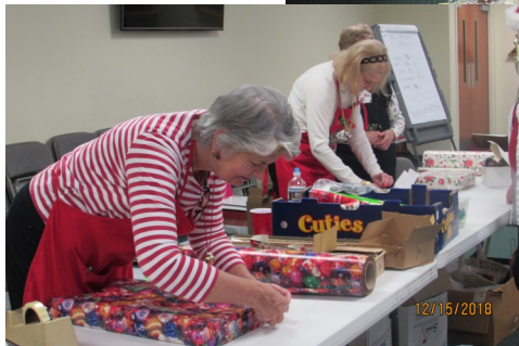
A Great Success!